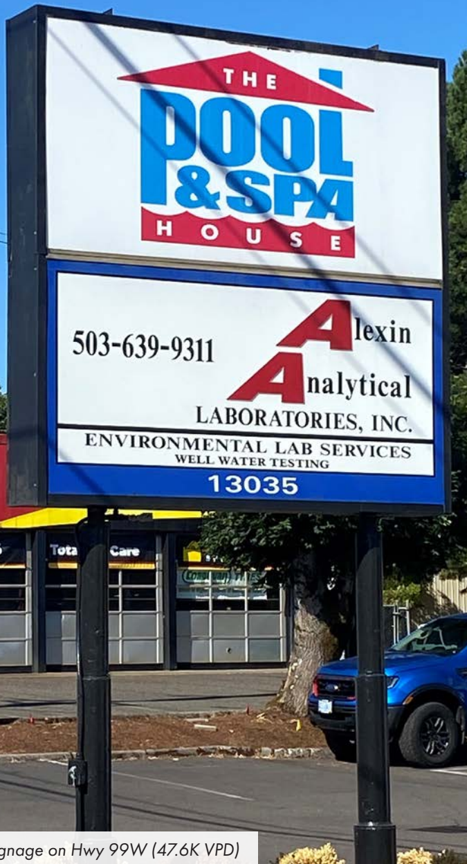
Signage on Hwy 99W (47.6K VPD)