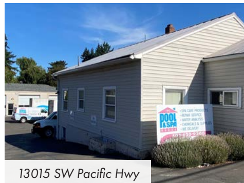
13015 SW Pacific Hwy