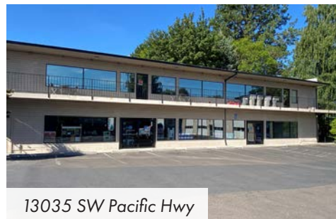
13035 SW Pacific Hwy