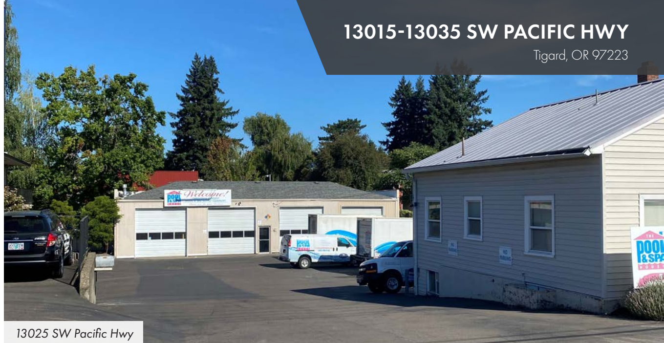
13025 SW Pacific Hwy