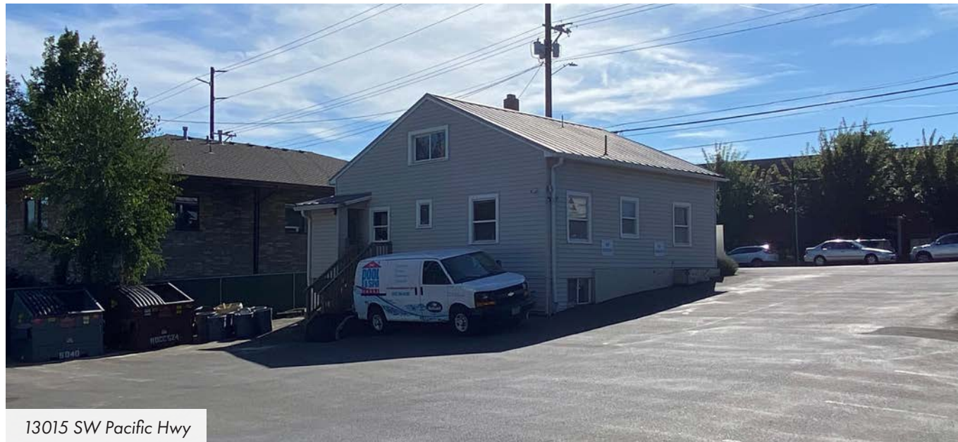
13015 SW Pacific Hwy

For more information or a property tour, please contact: