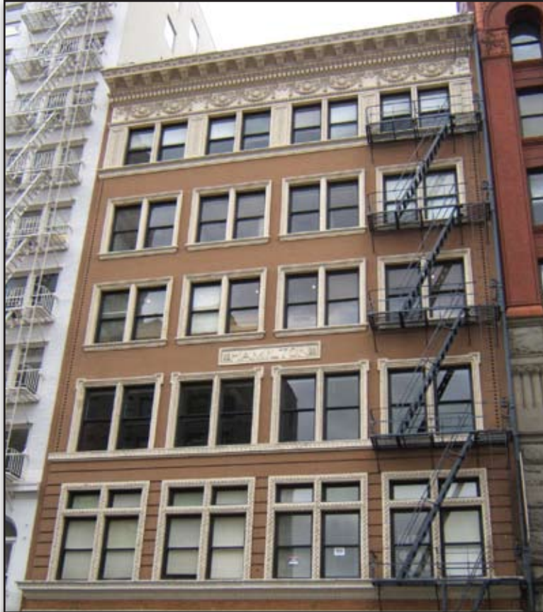
The Hamilton Building