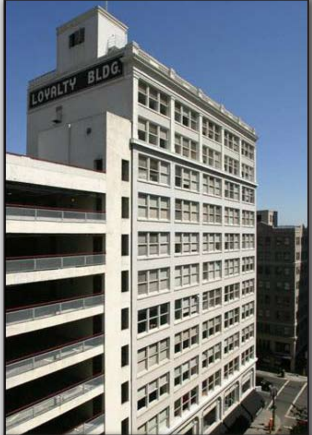
The Loyalty Building