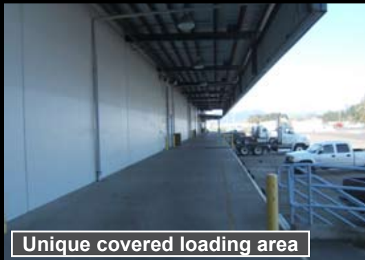
Unique covered loading area