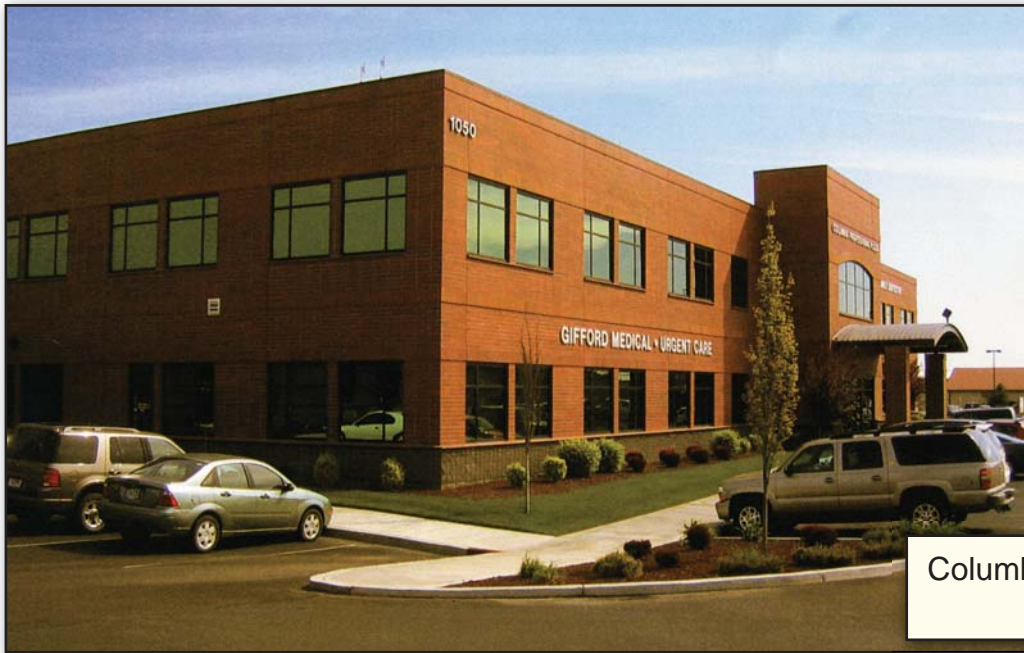
Columbia Professional Plaza II