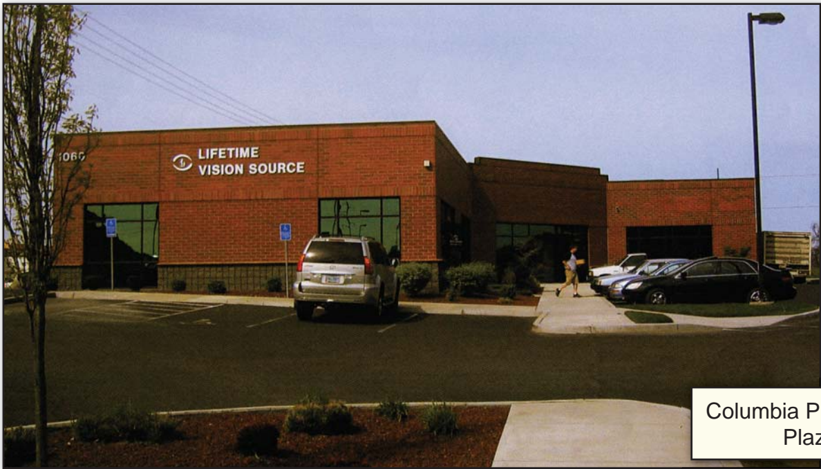
Columbia Professional Plaza I